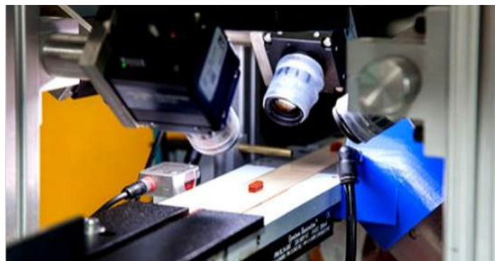
Camera based vision and quality inspection system