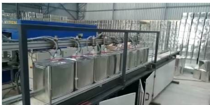
Leak Testing machine