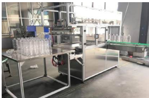
Empty bottles bag packing machine